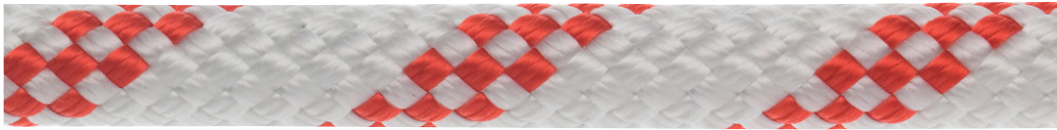
White/Red - 501 : 50 m, 601 : 60 m, 1001 : 100 m, 2001 : 200 m, 6001 : 600 m

The suppleness of the Prium 10.5 mm makes it a great choice for use with ascenders and descenders.