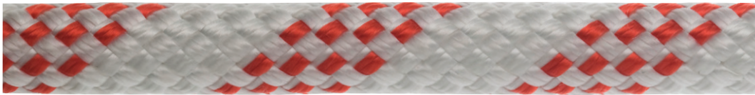
White/Red - 501 : 50 m, 601 : 60 m, 1001 : 100 m, 2001 : 200 m, 6001 : 600 m

The super strong polyamide core combines with the 32 carrier sheath for good handling and twisted yarns for a very high level of abrasion resistance.