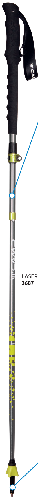
LASER ADJ 3687